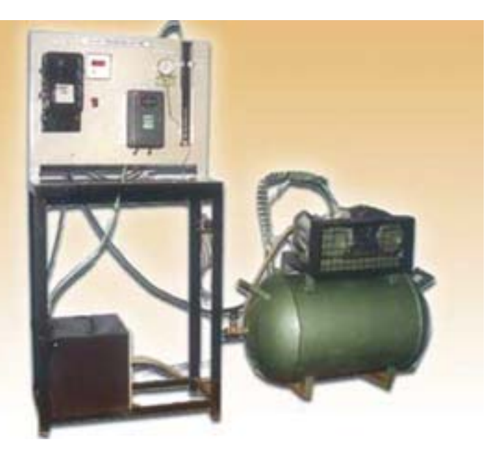
Measuring efficiency of compressor.

Energy is available in various forms from different natural sources such as pressure head of water, chemical energy of fuels, nuclear energy of radioactive substances etc. All these forms of energy can be converted into electrical energy by the use of suitable arrangement. In this process of conversion, some energy is lost in the sense that it is converted to a form different from electrical energy. Therefore, the output energy is less than the input energy. The output energy divided by the input energy is called energy efficiency or simply efficiency of the system.