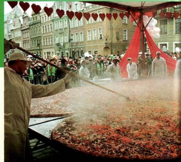
NAPLES, ITALY, ON VALENTINE'S DAY