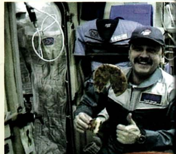
PIZZA IN SPACE