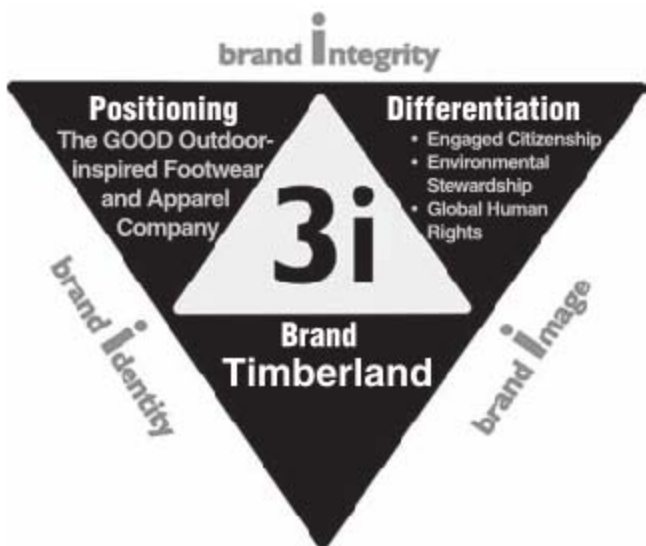
Figure 2.4 The 3i of Timberland