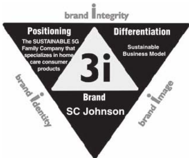
Figure 2.3 The 3i of S.C. Johnson