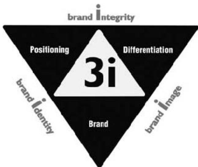
Figure 2.2 The 3i Model

The brand may have a clear identity in consumers' minds but not necessarily a good one. Positioning is a mere claim that alerts consumers to be cautious of an inauthentic brand. In other words, the triangle is not complete without the differentiation. Differentiation is the brand's DNA that reflects the true integrity of the brand. It is a solid proof that a brand is delivering what it promises. It is essentially about delivering the promised performance and satisfaction to your customers. Differentiation that is synergetic to the positioning will automatically create a good brand image. Only a complete triangle is a credible one in Marketing 3.0 (see Figure 2.2).