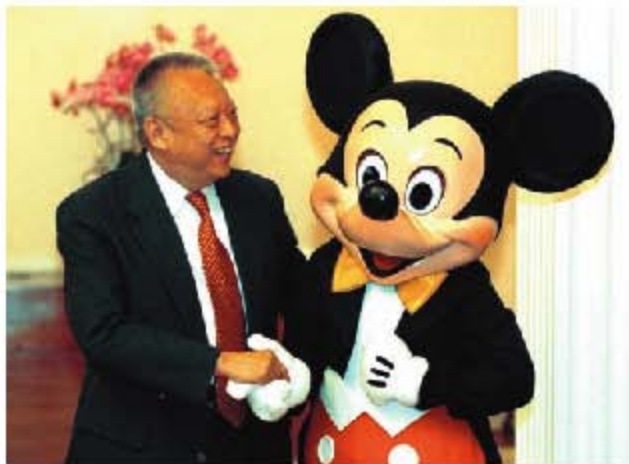
Tung Chee Hwa, at the time Chief Executive of the Hong Kong Special Administrative Region, consummated the deal with the Mouse for Asia's new Walt Disney World, which opened in 2005.

Informality being a way of life in the United States, even the largest contracts between companies are often sent through the mail for signature. In America, ceremony is considered a waste of time and money. But when a major agreement is reached with foreign companies, their executives may expect a formal signing ceremony involving CEOs of the respective companies. American companies are wise to accommodate such expectations.