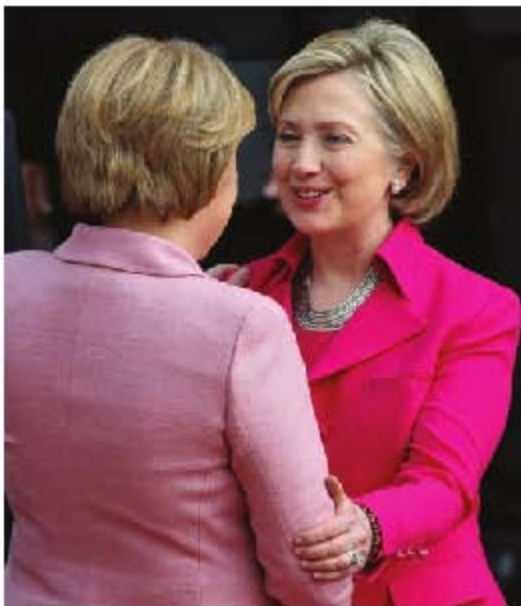
Women can get the job done. Here U.S. Secretary of State Hillary Clinton meets with German Chancellor Andrea Merkel.

In general, women are more comfortable talking one-on-one. The situation of speaking up in a meeting is a lot closer to boys' experience of using language to establish their position in a large group than it is to girls' experience of using language to maintain intimacy. That's something that can be exploited. Don't wait for the meeting; try to make your point in advance, one-to-one. This is what the Japanese do, and in many ways American women's style is a lot closer to the Japanese style than to American men's. 29