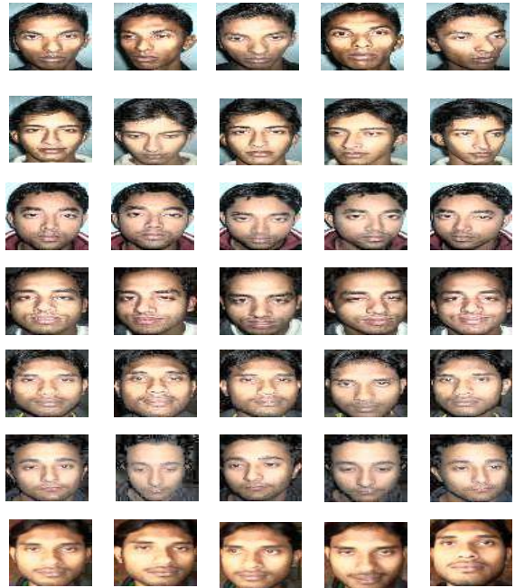
Fig. 2 Training set face images.