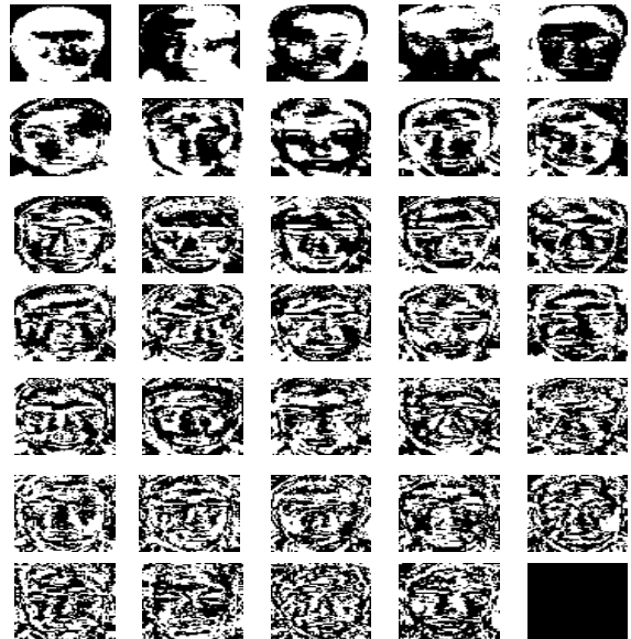
Fig. 3 Eigenfaces with highest eigen values.

With this analysis, the calculations are greatly reduced, from the order of the number of pixels in the images ( N^2 ) to the order of the number of images in the training set ( \Gamma_i ). The success of this algorithm is based on the evaluation of the eigenvalues and eigenvectors of the real symmetric matrix \mathbf{L} that is composed from the training set of images.